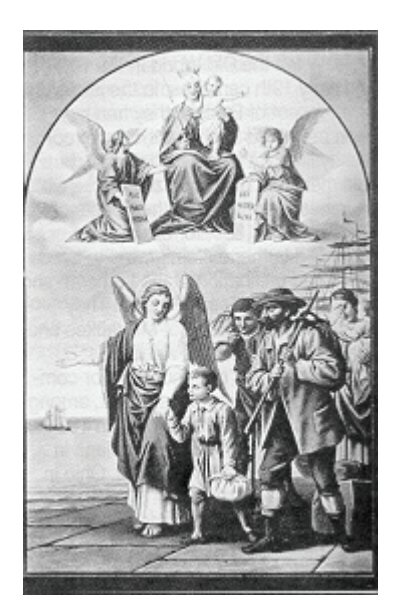
Archangel Raphael was the patron saint of emigrants, both for Catholics and Lutherans. From W. Löhe's Reisende [Raphael, Prayer Booklet for Travelers].

Politically-motivated emigration began in earnest in the 1830s when the reactionary forces governing in the post-Napoleonic period persecuted liberals and democrats. Several thousand revolutionaries left after the failed German Revolution of 1848, most of whom at first considered themselves asylum seekers rather than emigrants. Likewise, Bismarck's Anti-Socialist Law (1878-90) caused quite a few Social Democratic activists to move to New York and Chicago to continue their class struggle. The next wave of politically-motivated emigrants consisted of groups marked for annihilation by the National Socialist dictatorship between 1933-45, among them Social Democrats and other opponents of the regime, and above all Jewish Germans and other Europeans threatened with mass murder and genocide. In the postwar era after 1945, when Germany lay in ruins, the traditional principal factor inducing emigration, namely economics, was back at work.