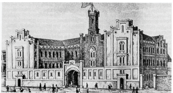
The Emigrants' Building in Bremerhaven, built in 1849.

In a broader sense, economic and political motivation cannot be separated. As a matter of fact, when the decision to emigrate was impelled by the desire to become a farmer with one's own land or a craftsman with one's own business, this also implied a rejection of the rigidity of the social class structure in the authoritarian German states. Thus, from his point of view, an official in the state of Nassau