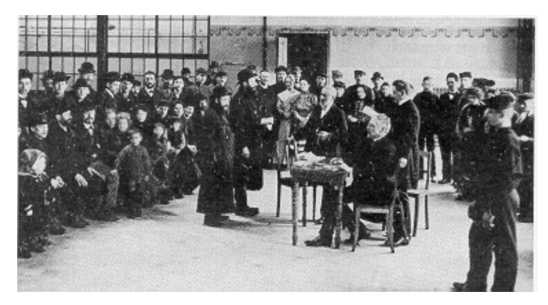
Dispatch hall for Jewish emigrants at the emigration facilities of the Hamburg-America Line in Hamburg-Veddel. 1909.

Religiously-motivated emigrant groups typically left the Old World in the 18th and early 19th centuries. In the intolerant environment of Europe, they had not been permitted to shape their own community life. Not just pietistic sects, but also members of recognized state churches, went through the trouble of emigration. In 1839, for example, over 1,000 Old Lutherans emigrated to evade the forced unification of the Lutheran and Reformed churches